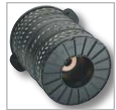
H 34 1790 with conical clearance