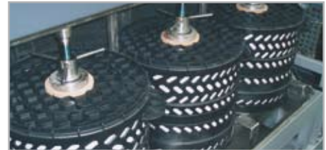
H 34 1290/3